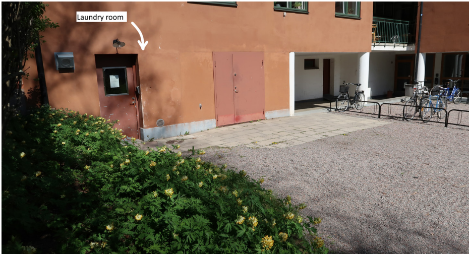
Laundry room at S:t Larsgatan 6B