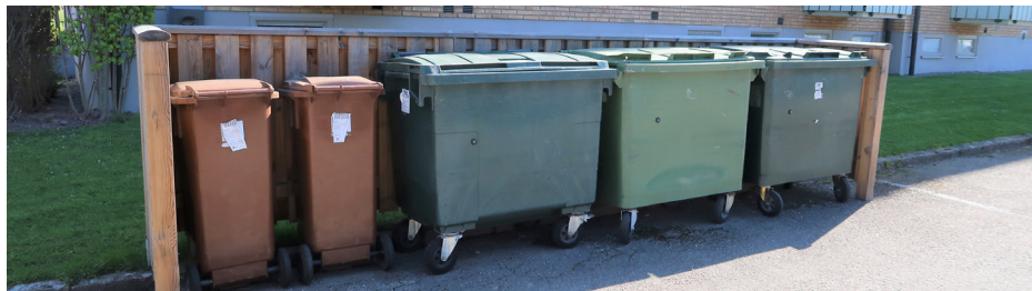
Krongatan and Karlsrogatan

For more information, visit www.uppsala.se .