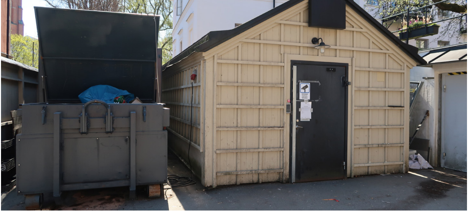
Recycling facility at Snerikes nation