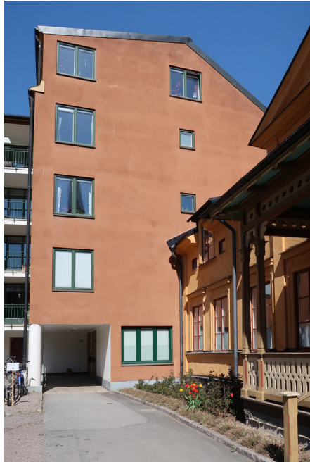
S:t Larsgatan 6B

The room that has been allocated to you is the residence of the contracted tenant only. You are responsible for visiting guests and must make sure that guests do not disturb others and respect regulations in the building. The tenant is not allowed to have visitors staying overnight in the room. For guest accommodation please have a look at the website www.studentboet.se (under "Temporary Housing" for a list of hostels and hotels in and around Uppsala).