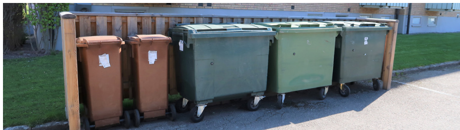
Krongatan and Karlsrogatan

For more information, visit www.uppsala.se .